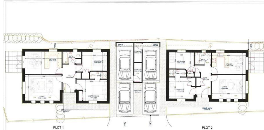
SK10 PLANS 1:100 @ A3