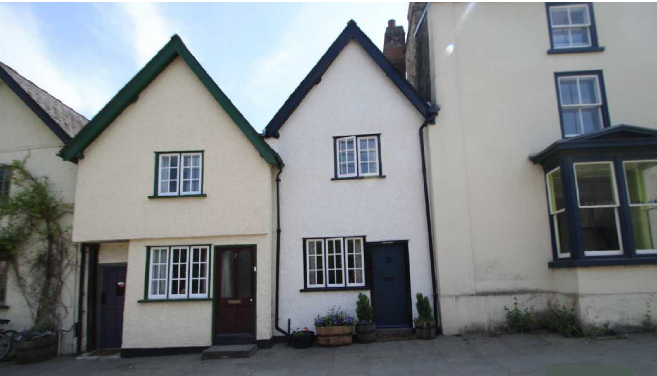
Hall Cottage, 3 Oak Villas Broad Street, Presteigne, LD8 2AE