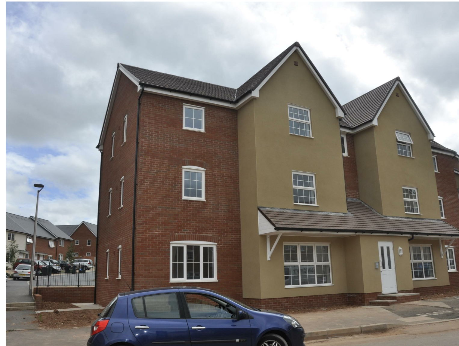
9 Old Park Avenue, Pinhoe, Exeter, Devon, EX1 3WD

A fantastic opportunity to let this top floor apartment in a popular development on the outskirts of Exeter. The accommodation comprises; A light and spacious living/dining room, modern kitchen, two double bedrooms, master with en-suite shower room and a family bathroom. It also benefits from gas central heating and PVCu double glazing and has an allocated parking space. The property is close to Pinhoe train station which is on the central line into London and there are lots of amenities close by. Available immediately. No pets allowed.