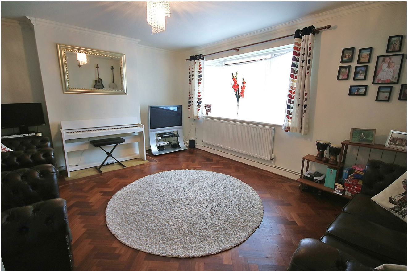
LOUNGE: PIC. 2