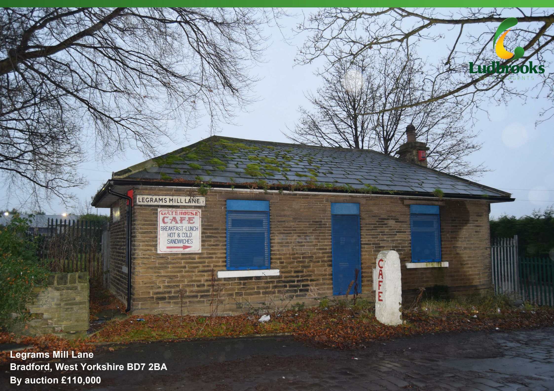
Legrams Mill Lane Bradford, West Yorkshire BD7 2BA By auction £110,000