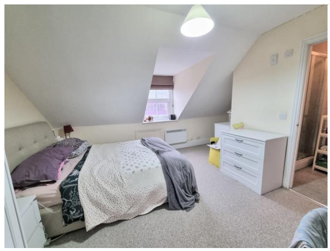
BEDROOM 15' 10" x 8' 0" (4.8m x 2.4m) Front aspect window, electric radiator, carpet and door to the en-suite.

EN-SUITE SHOWER ROOM Double sized shower, low-level WC, wash hand basin, electric radiator and tiled floor.