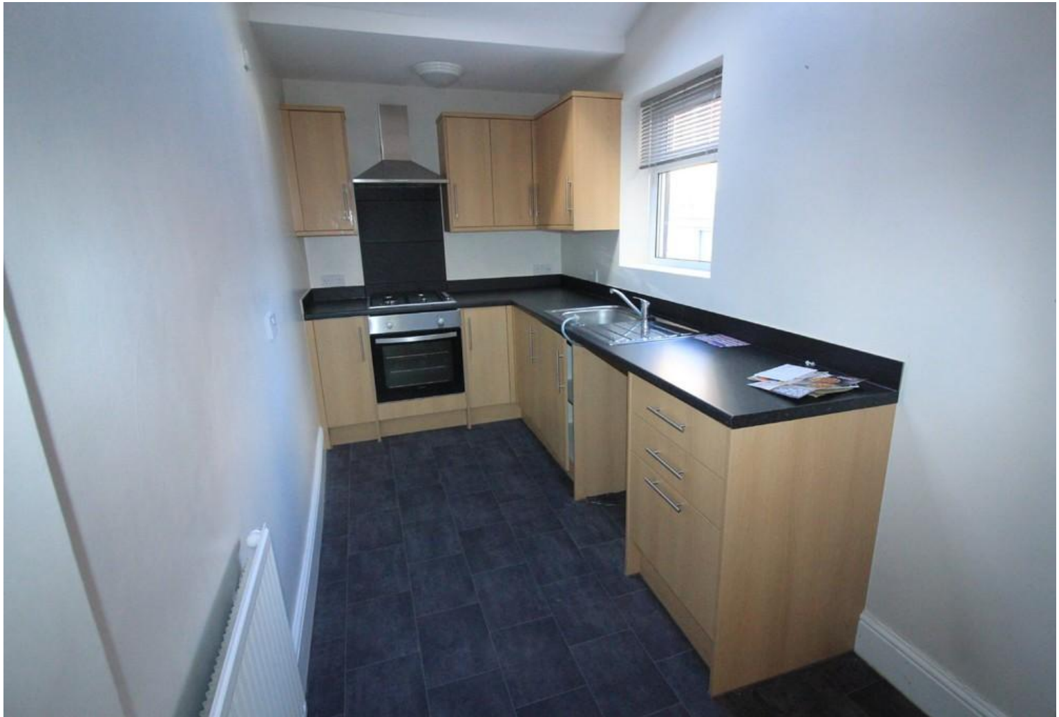
5 Ivy Terrace, Whitehall, Darwen