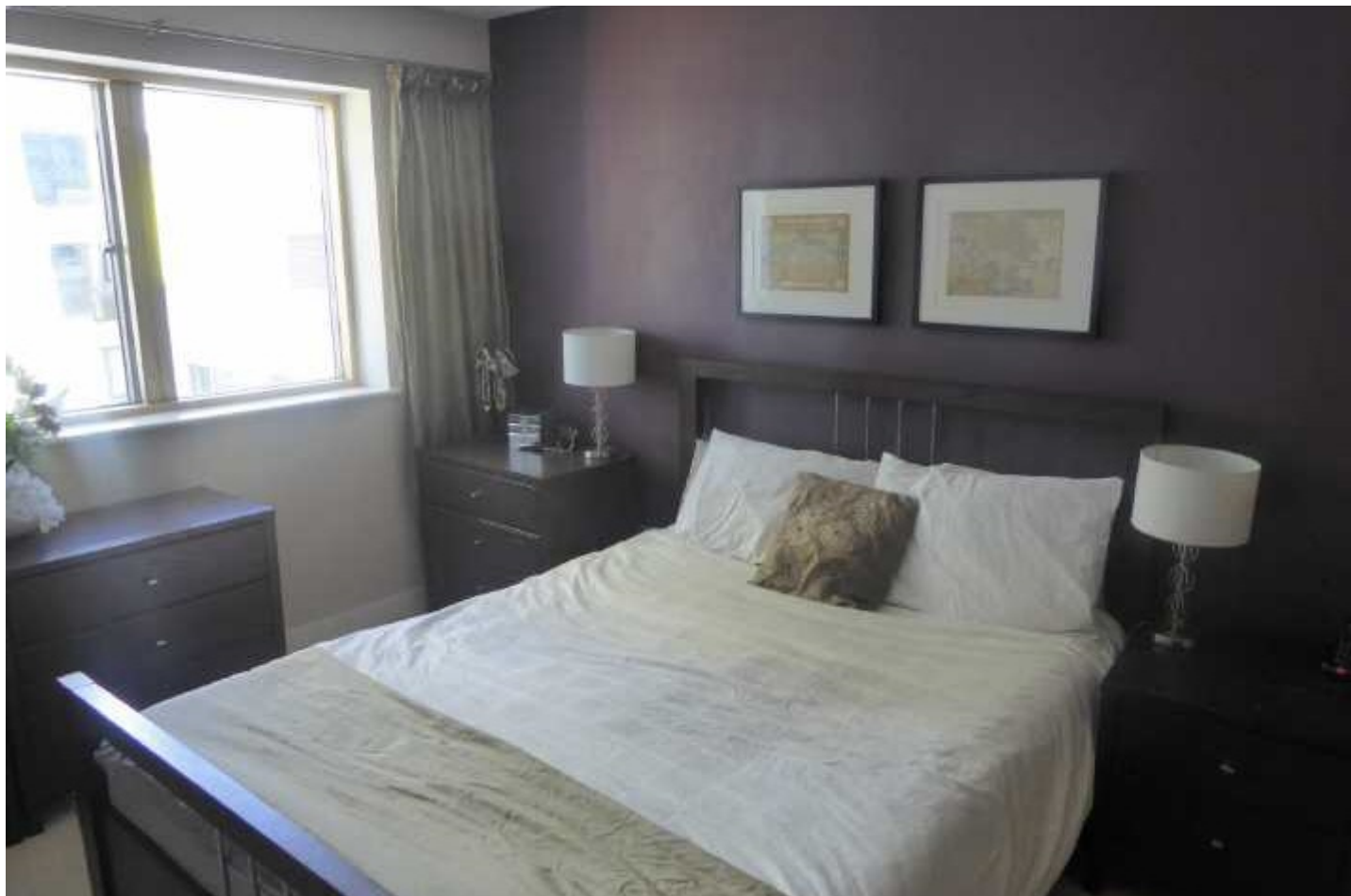
Garden House, Manchester M4 1HQ Price £200,000