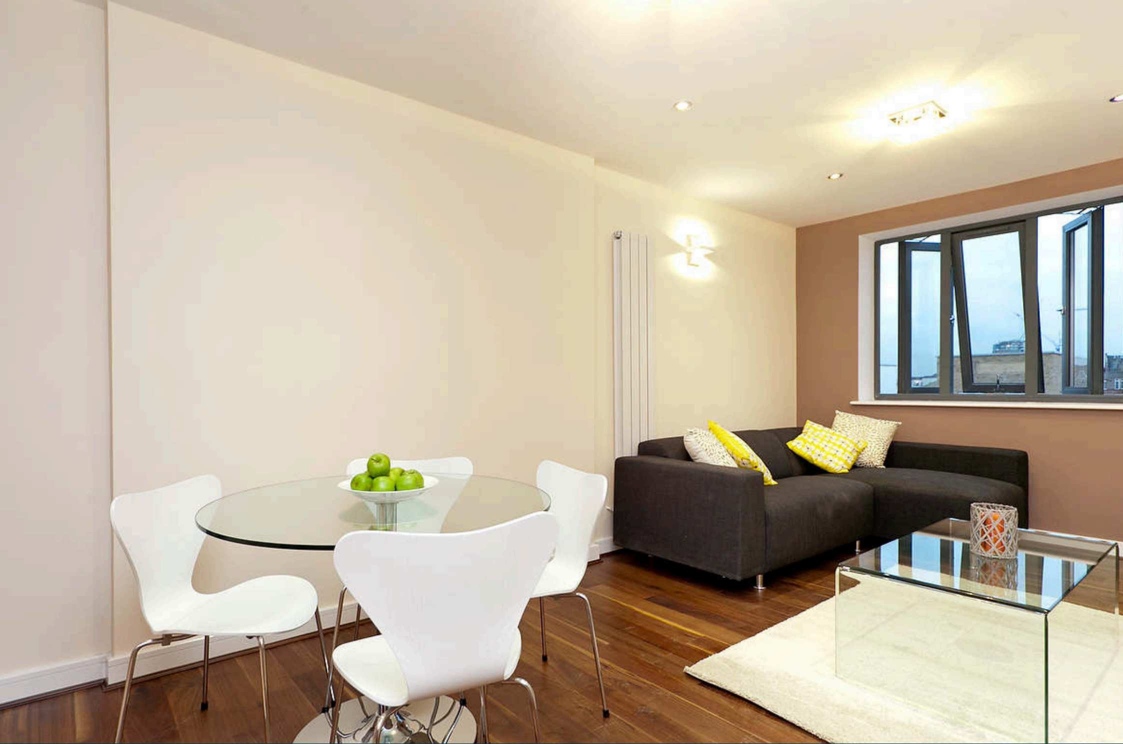
Bains Apartments, 2a Philpot Street, London, E1 2DW