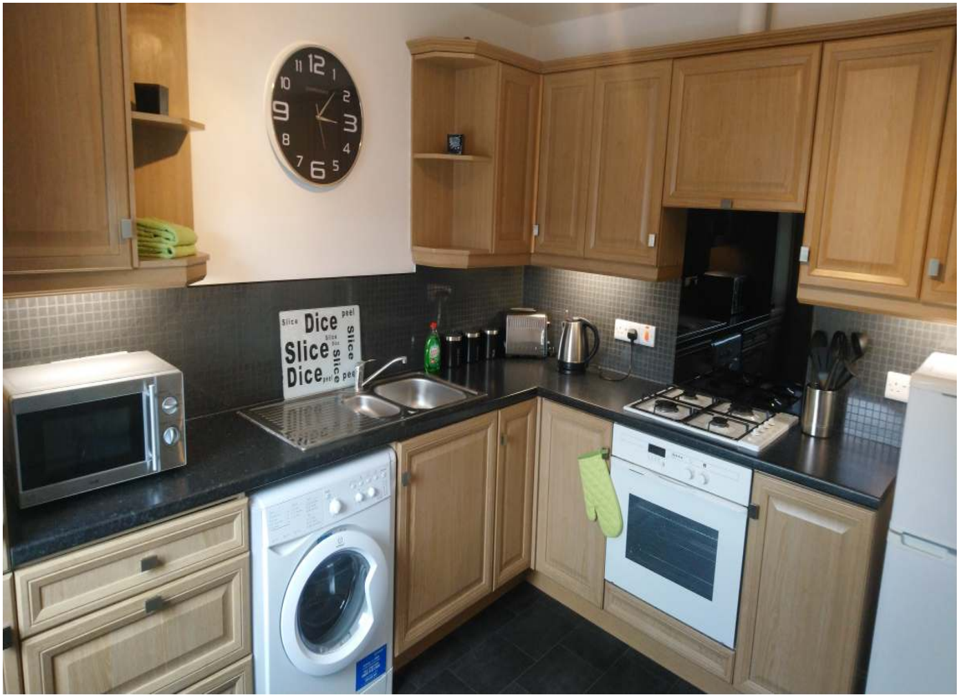
Albury Mansions, Aberdeen, AB11