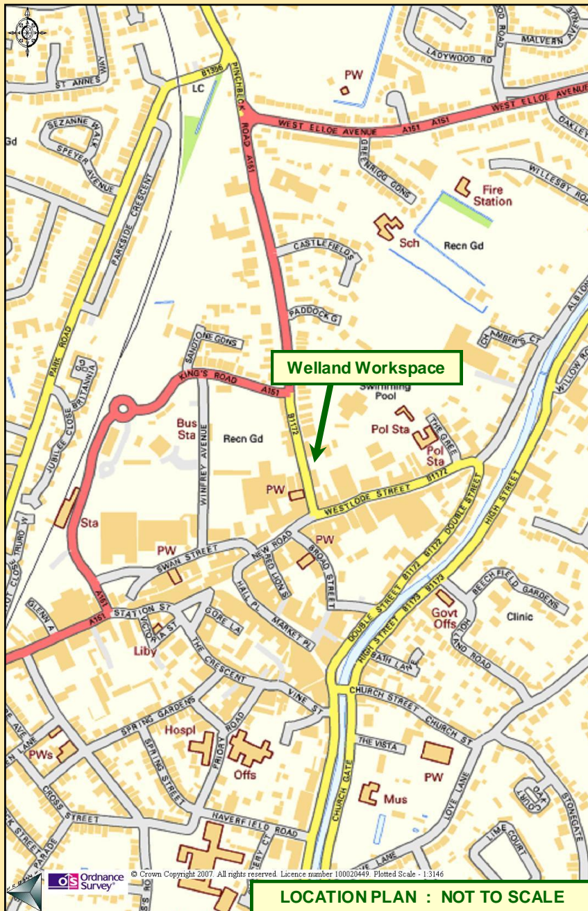
LOCATION PLAN : NOT TO SCALE