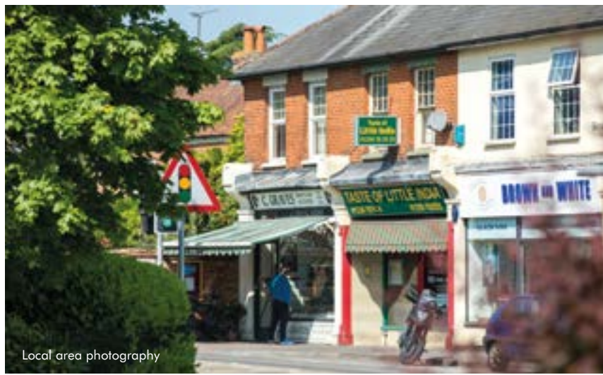
Local area photography