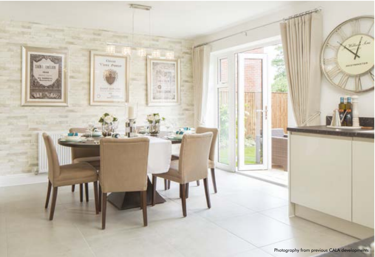
Photography from previous CALA developments