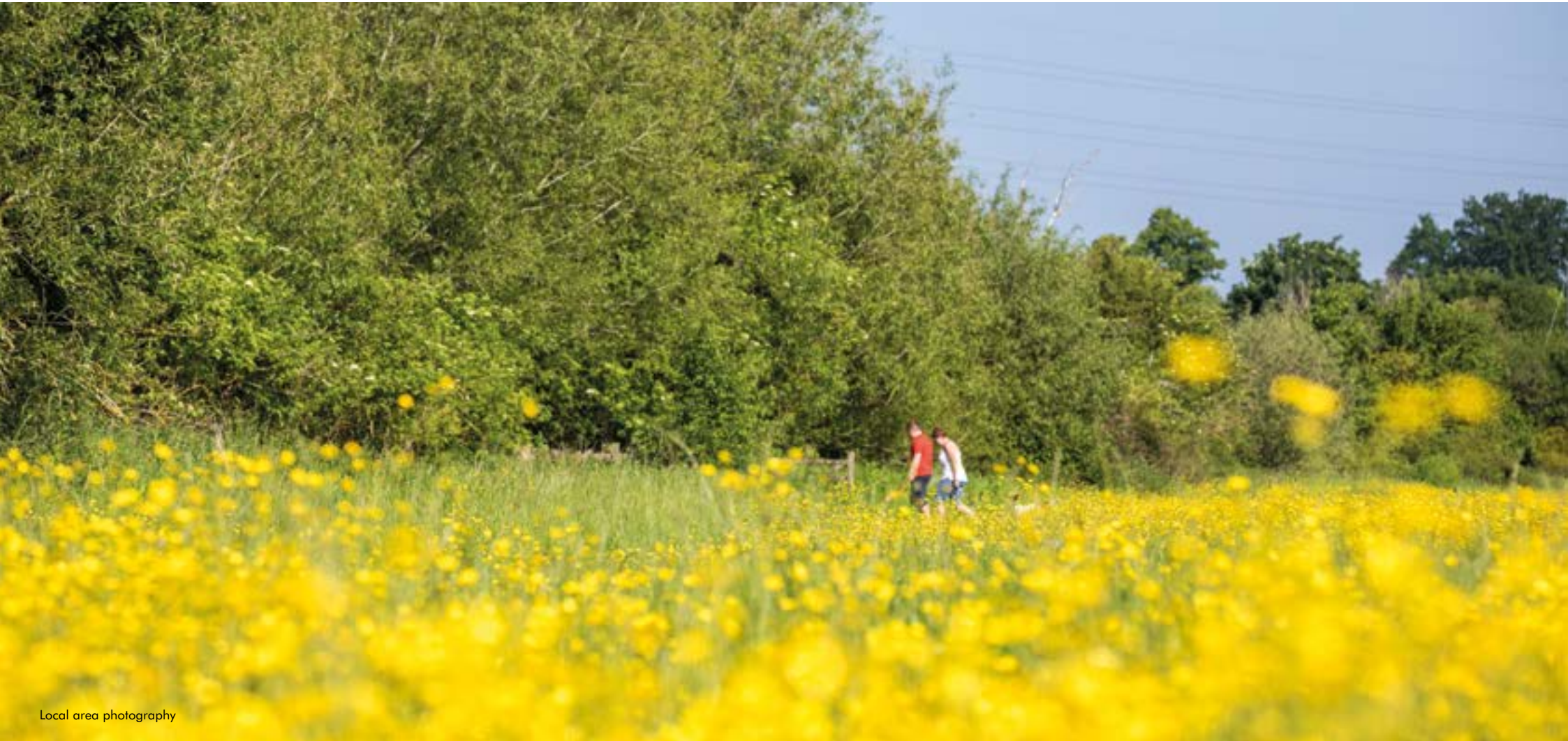
Local area photography