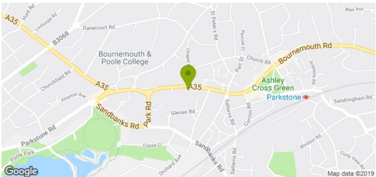
Illustration for identification purposes only. Not to scale Ref: 214132