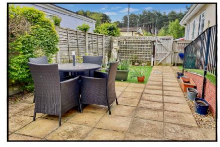
Pitch Fee: approx £268.45 per month Subject to Annual Review Council Tax Band: 'A' Tenuro