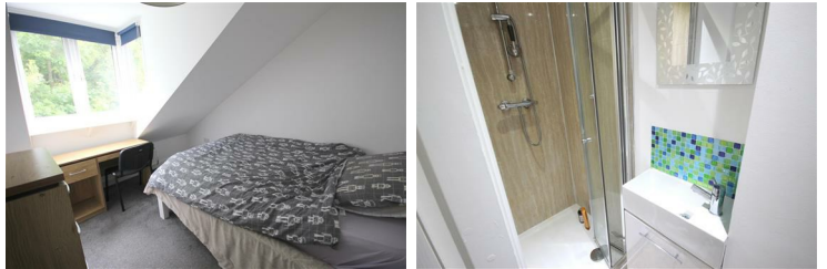
Bedroom 5 with en-suite