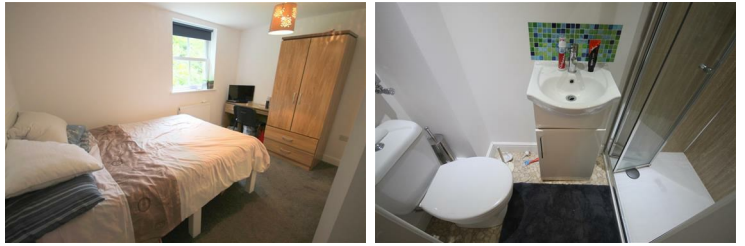
Bedroom 4 with en-suite