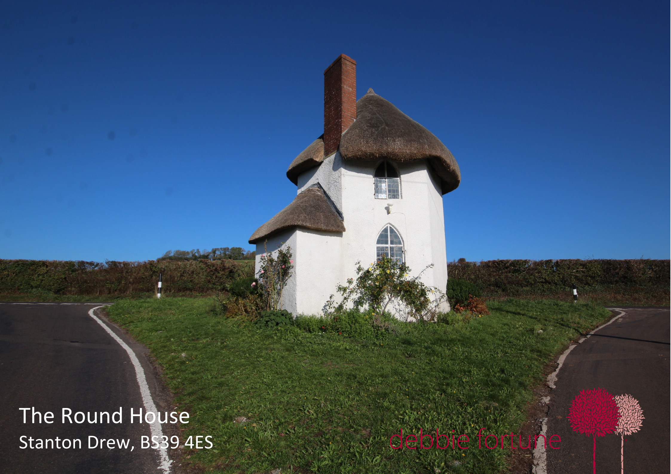
The Round House Stanton Drew, BS39 4ES