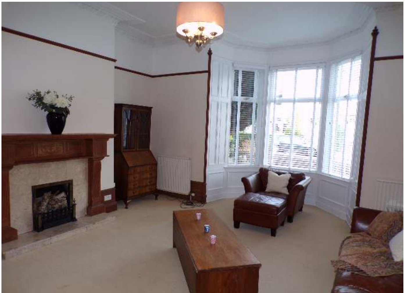
Blenheim Place, Aberdeen,