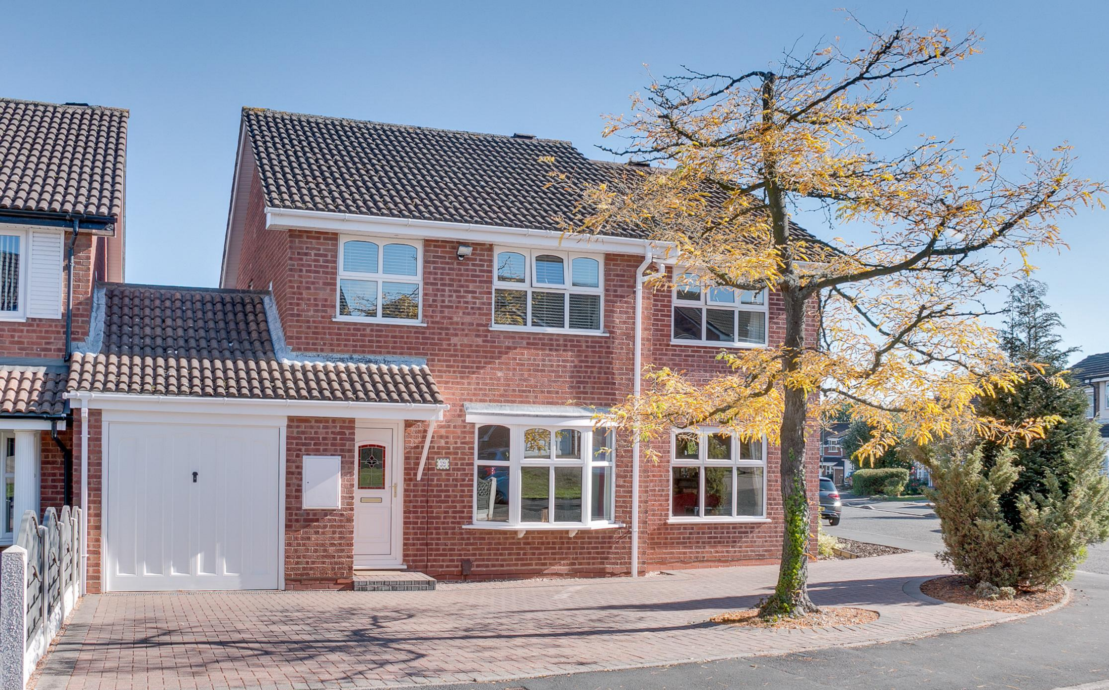
Varlins Way, Kings Norton, Birmingham, B38 9UX | £360,000 Four Bedroom Link-Detached House