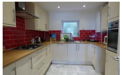
Winterbourne Hill Winterbourne, Bristol, , BS36 1LT