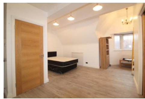
Golders Green, London NW11 £1,050pcm