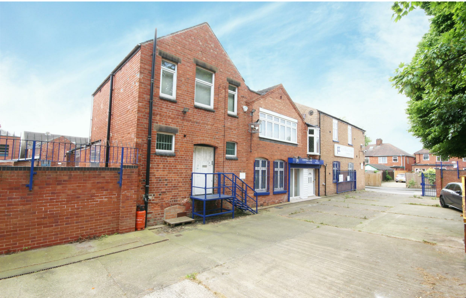
Hazel Street, Nottingham, Nottinghamshire NG6 8EA