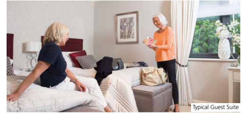
Typical Guest Suite