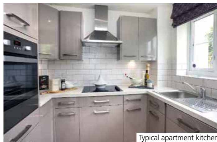
Typical apartment kitchen