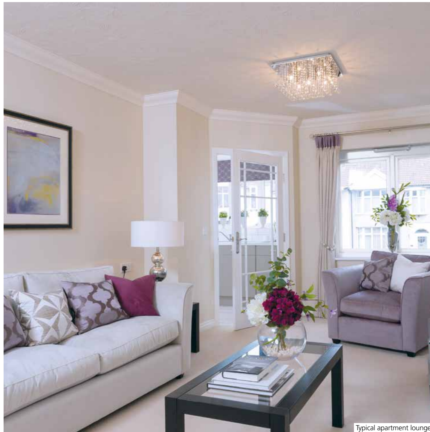
Typical apartment lounge

Churchill Retirement Living is an award-winning specialist in the development of purpose built apartments for those looking for an independent, active, safe and secure lifestyle in their retirement.