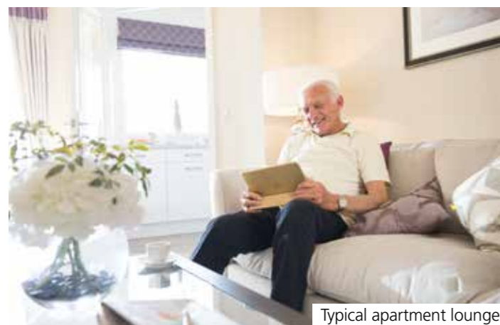
Typical apartment lounge