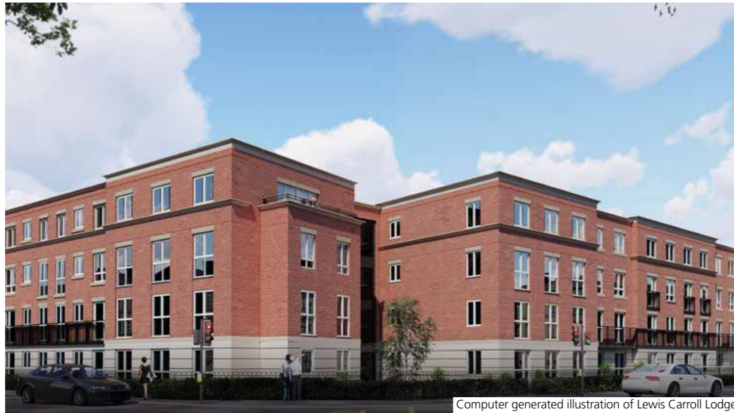
Computer generated illustration of Lewis Carroll Lodge