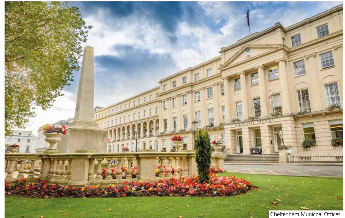
Cheltenham Municipal Offices