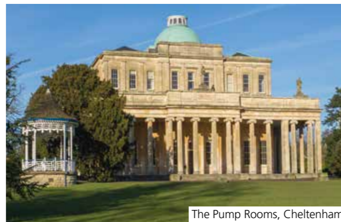
The Pump Rooms, Cheltenham