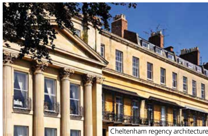
Cheltenham regency architecture

There are also local air connections for private light aircraft and flights to and from the Isle of Man, Jersey and Ireland through the local Gloucestershire Airport.