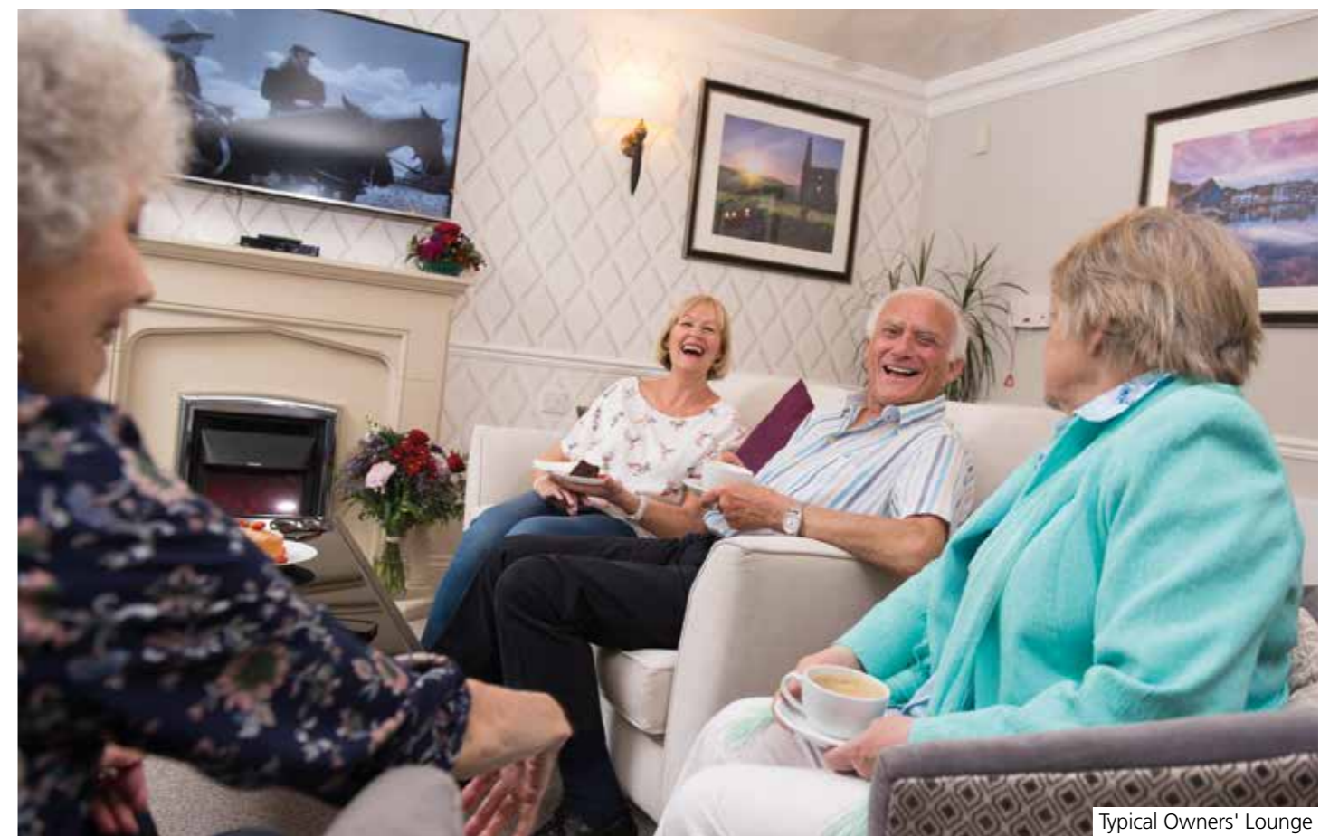
Typical Owners' Lounge

Finally, as a thank you, all Owners of a Churchill apartment will receive a Reward Card, offering exclusive discounts from a number of national brands across the UK, as well as local businesses in the area.