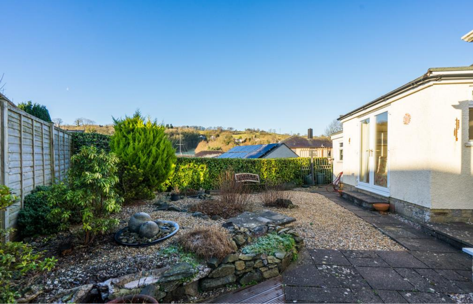
Rear Garden Area