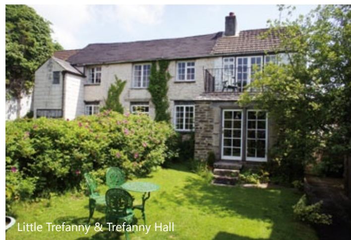
Little Trefanny & Trefanny Hall