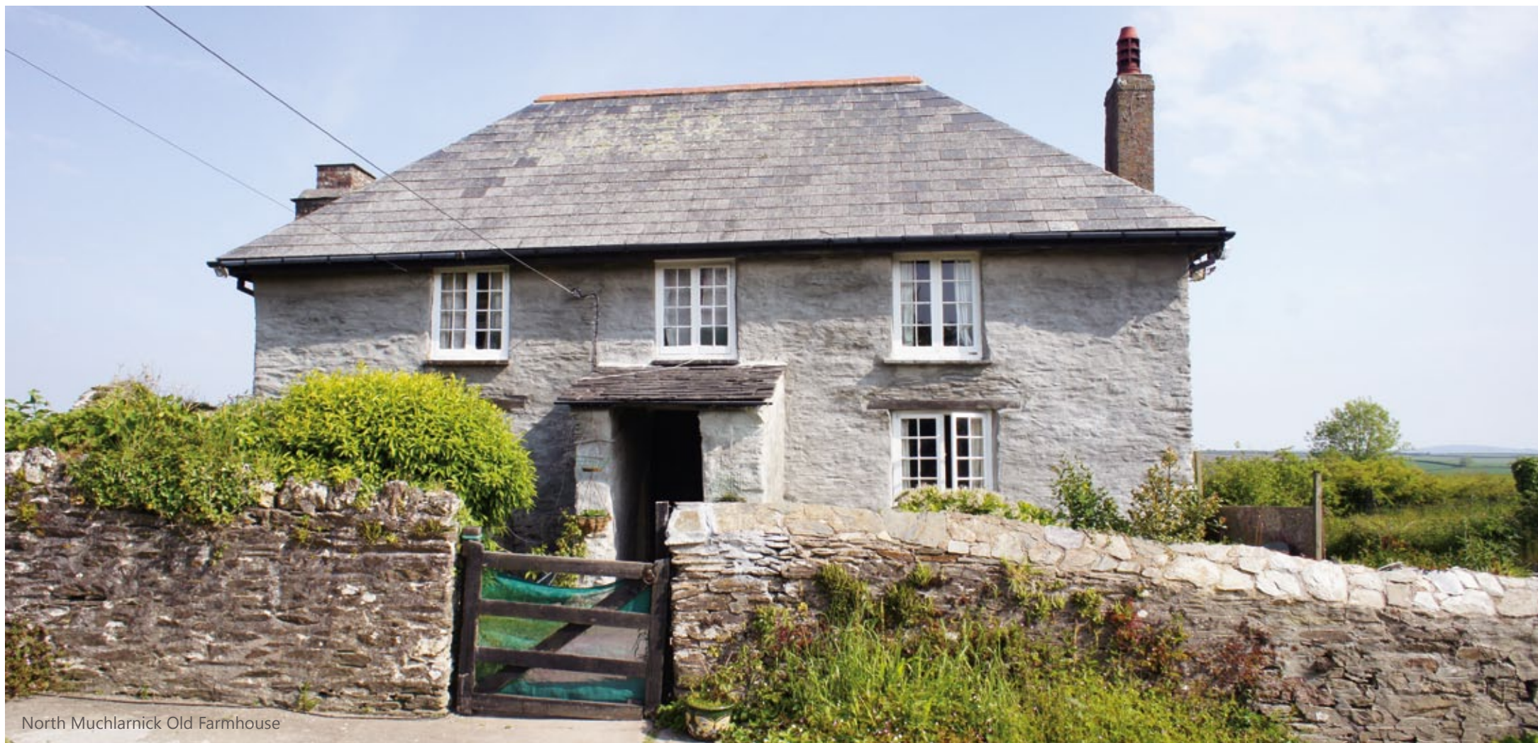
North Muchlarnick Old Farmhouse

Lots 1 and 2 are within easy reach of one another via either a footpath or a country lane.