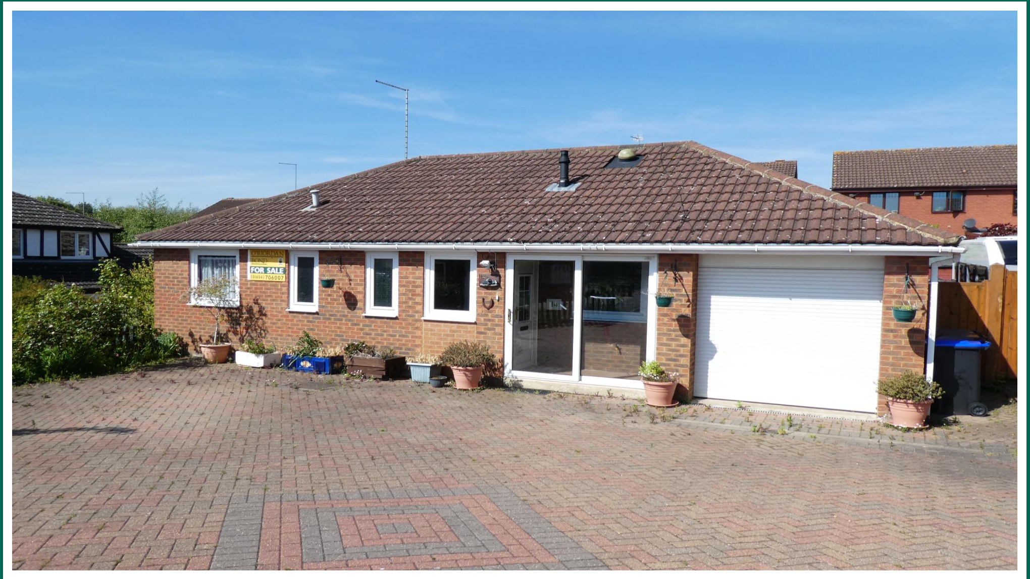
Kimble Close East Hunsbury, Northampton