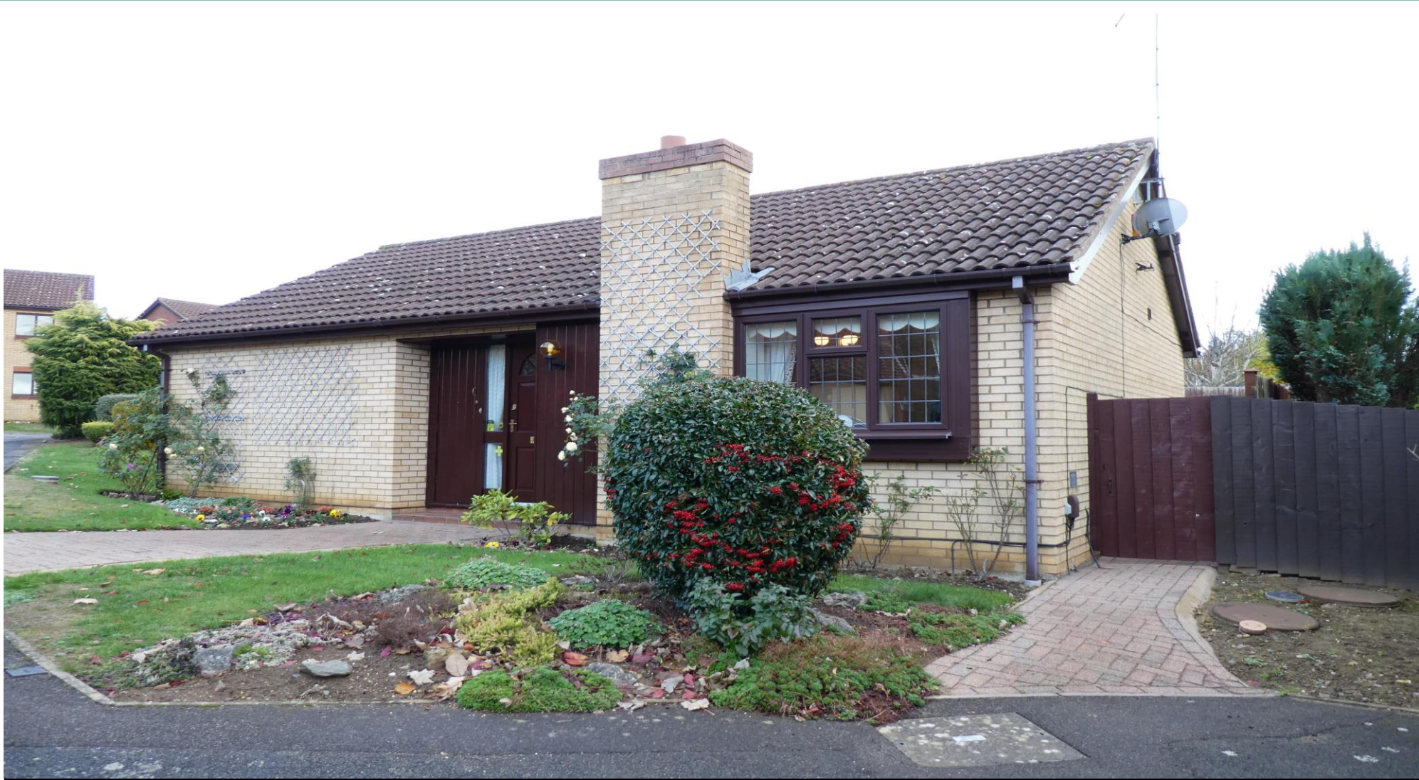
The Hayride East Hunsbury, Northampton