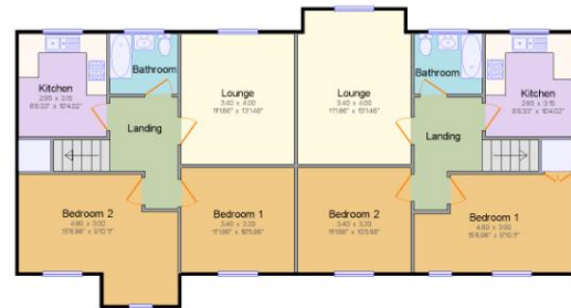
Block 2: First Floor

Total approx floor area: 249.5 m 2 (2674.7 ft 2 ) Block 1 Ground Floor: 123.1 m 2 (1324.6 ft 2 ) Block 1 First Floor: 125.4 m 2 (1350.1 ft 2 )