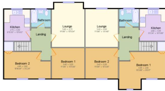
Block 4: First Floor