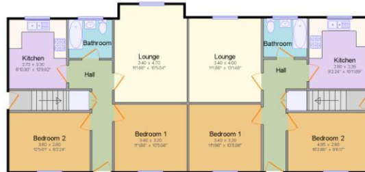
Block 4: Ground Floor

Total approx floor area: 2526 m 2 (2718.9 ft 2 ) Block 4: Ground Floor: 1251 m 2 (1346.1 ft 2 ) Block 4: First Floor: 1275 m 2 (1372.8 ft 2 )