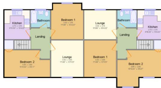
Block 1: First Floor