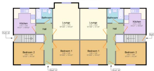
Block 3: Ground Floor

Total approx floor area: 250.3 m 2 (2694.0 ft 2 ) Block 3 Ground Floor: 123.9 m 2 (1333.6 ft 2 ) Block 3 First Floor: 126.4 m 2 (1360.3 ft 2 )