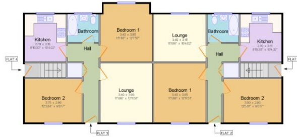
Block 1: Ground Floor

Total approx floor area: 249.5 m 2 (2674.7 ft 2 ) Block 1 Ground Floor: 123.1 m 2 (1324.6 ft 2 ) Block 1 First Floor: 125.4 m 2 (1350.1 ft 2 )