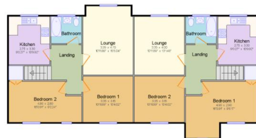
Block 3: First Floor

Total approx floor area: 250.3 m 2 (2693.9 ft 2 ) Block 2 Ground Floor: 124.0 m 2 (1334.6 ft 2 ) Block 2 First Floor: 126.3 m 2 (1359.1 ft 2 )