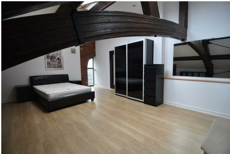
BEDROOM ONE SECOND ANGLE