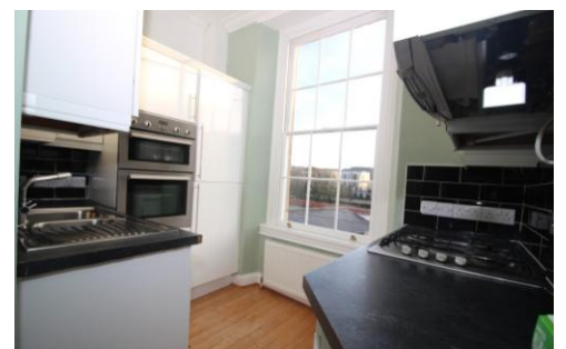
Albion Terrace Bath, BA1 3AF