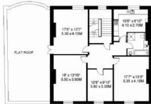
SECOND FLOOR 1332 SQ.FT.

PLUS CAR PARK 50'5" x 54'6" 15.10 x 16.60M