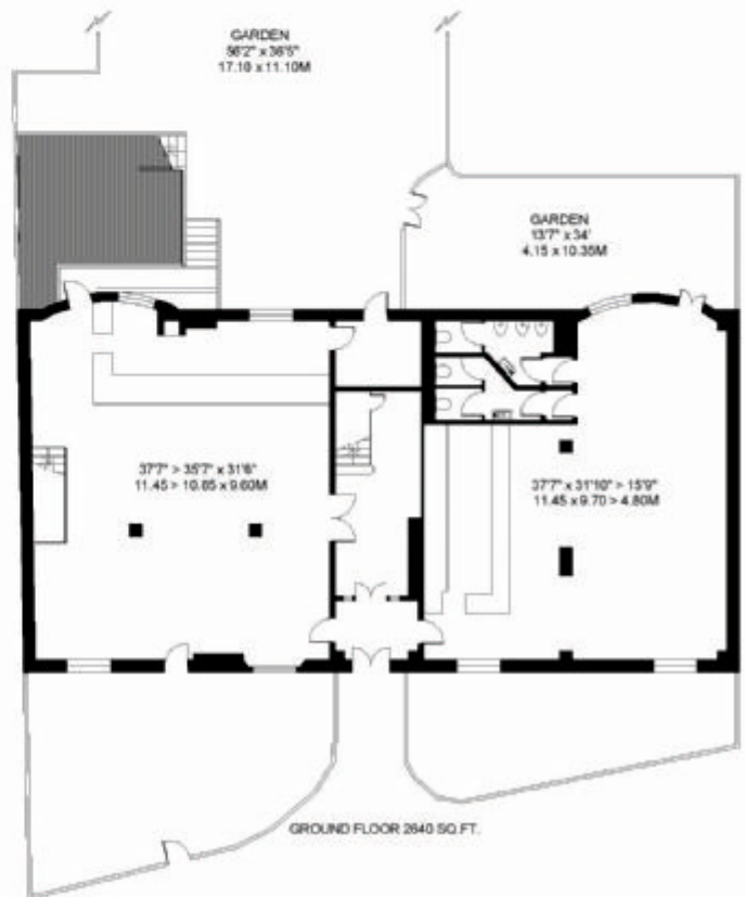
GROUND FLOOR 2640 SQ.FT.

COPYRIGHT: FLOORPLAN PRODUCED FOR "KNIGHT FRANK" BY FLOORPLANNERS This plan is not to scale (unless specified), and is for guidance only, and must not be relied upon as a statement of fact. All measurements and areas are approximate only, and have been prepared in accordance with the current edition of the RICS Code of Measuring Practice. Please read the Important Notice on the last page of the text of the particulars.