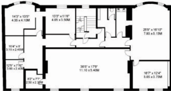
FIRST FLOOR 2672 SQ.FT.