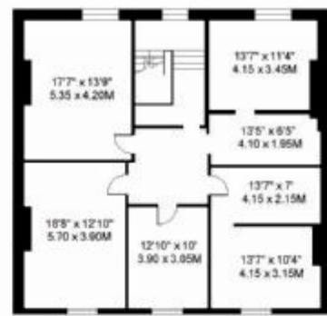
THIRD FLOOR 1345 SQ.FT.