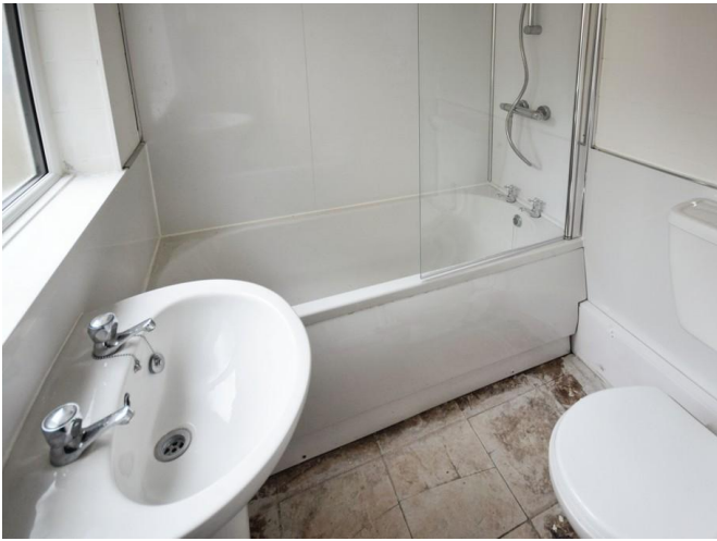
UPVC double glazed window to side elevation.