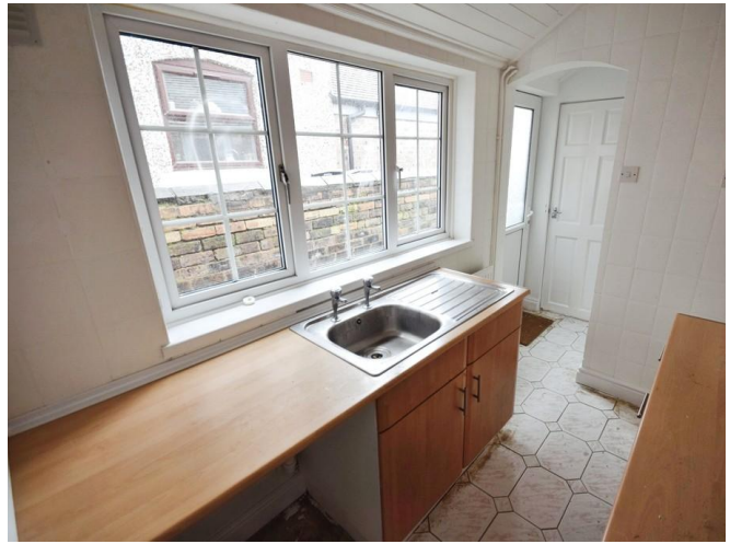
REAR HALL Vinyl tile effect flooring, part glazed UPVC door leading to rear yard.