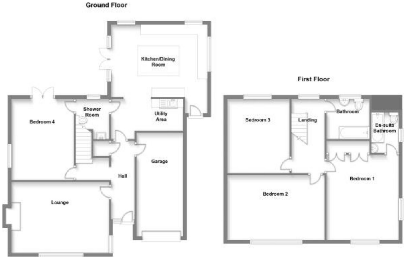
Indicative floor plans only - NOT TO SCALE - All floor plans are included only as a guide and should not be relied upon as a source of information for area, measurement or detail.

Cabasson, 103 Bay View Road, Benllech, Isle Of Anglesey, LL74 8TU