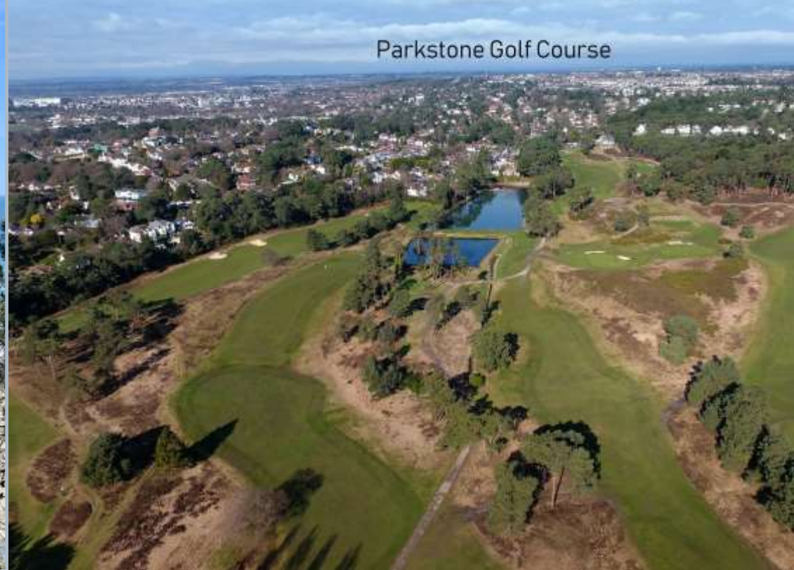
Parkstone Golf Course