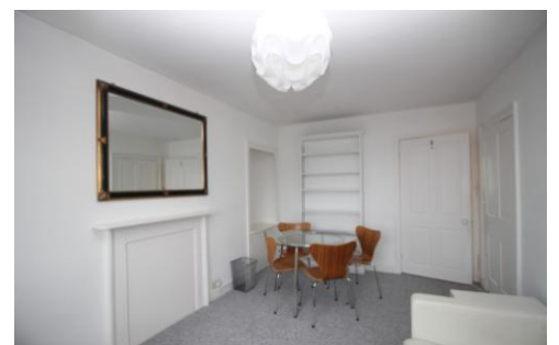
Raby Place Bath, BA2 4EH