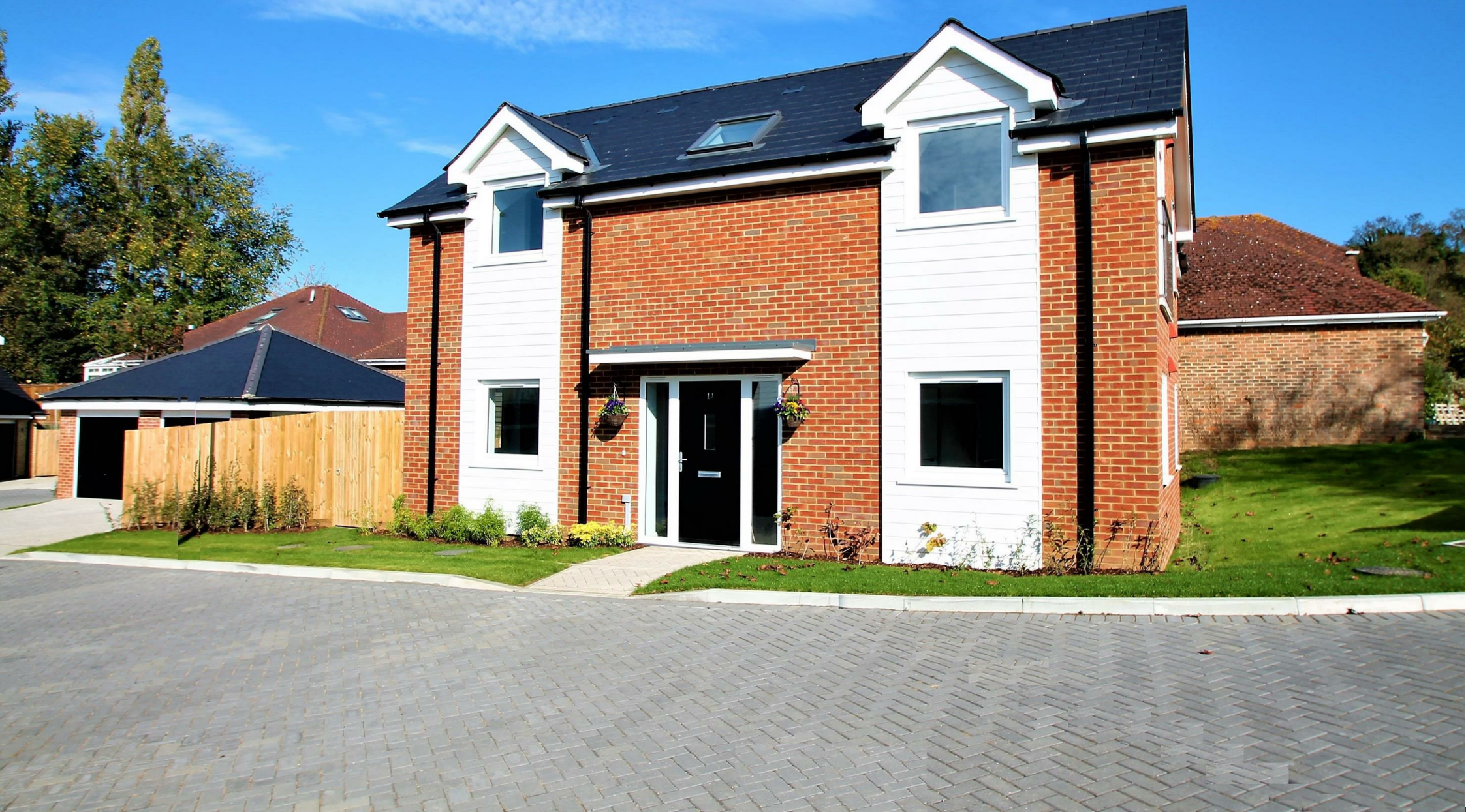
PLOT 5 CASTLE VIEW off Castle Dene, Maidstone, Kent, ME14 2NH Price £495,000