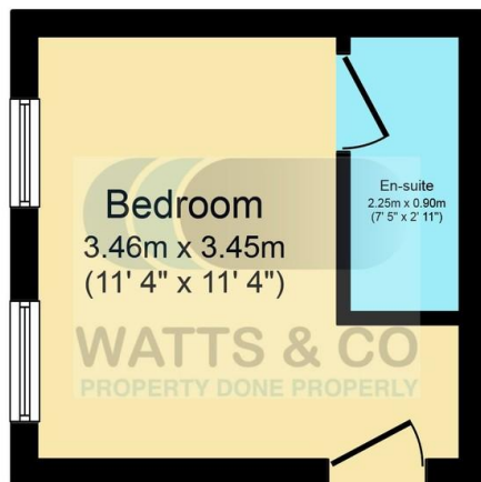
Floor Plan 12.0 sq. m. (129 sq. ft.)

This floor plan is for illustration purposes only and may not be representative of the property. The position and size of doors, windows and other features are approximate. Unauthorized reproduction prohibited. © PropertyBOX