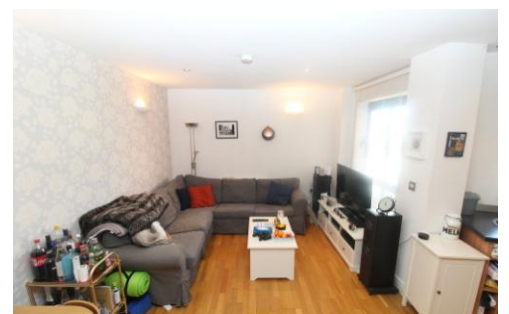
Brook House, Ellesmere Street Manchester M15 4QS