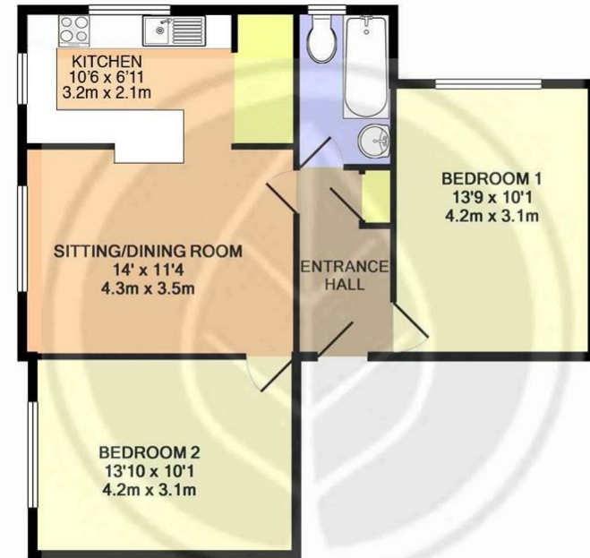
PHEASANT CLOSE, BERKHAMSTED HP4 2HH (PRODUCED FOR OAKLEYS) TOTAL APPROX. FLOOR AREA 598 SQ.FT. (55.6 SQ.M.) No accuracy to this image, text or measurements is guaranteed Made with Metropix ©2012

These particulars are produced in good faith, are set out as a general guide only and do not constitute any part of a contract. None of the statements are to be relied on as a statement of fact. Areas, measurements or distances are given as a guide only. We have not tested any of the equipment, appliances or services to this property nor do we have knowledge of any defects.