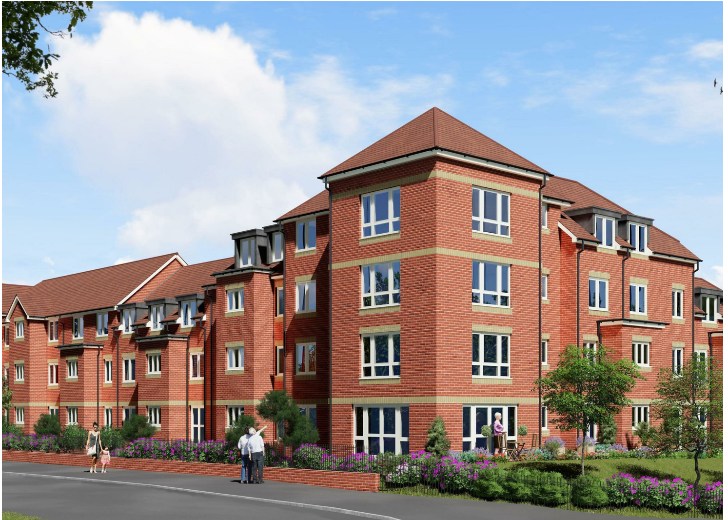
Quinton Lane Quinton, Birmingham B32 2AW