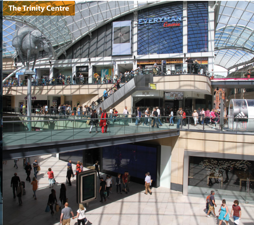
The Trinity Centre

The city has a strong historical heritage and remains a strong centre for business. Leeds is also an exceptionally green city; within just a few miles of the centre, the city opens out onto the landscape, townships and villages of the Yorkshire Dales .