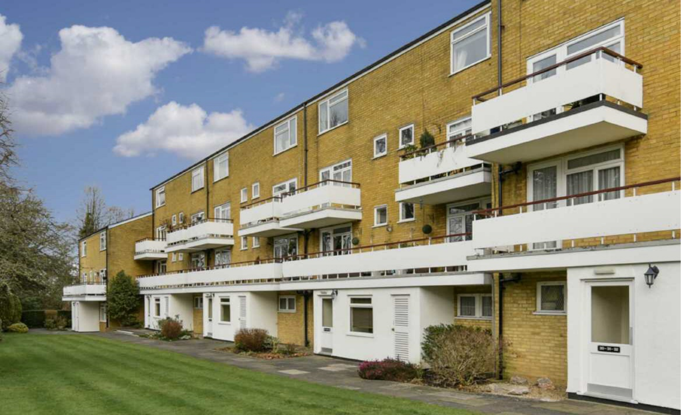
Well House, Banstead