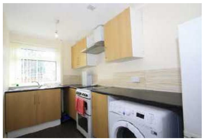
GUIDE PRICE £114,950