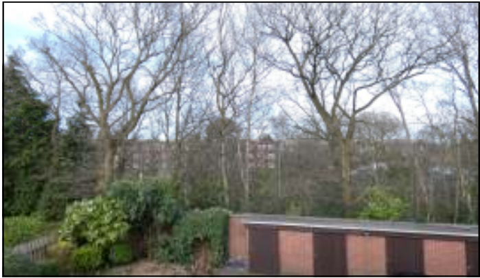
Astoria House, Belwell Lane, Four Oaks