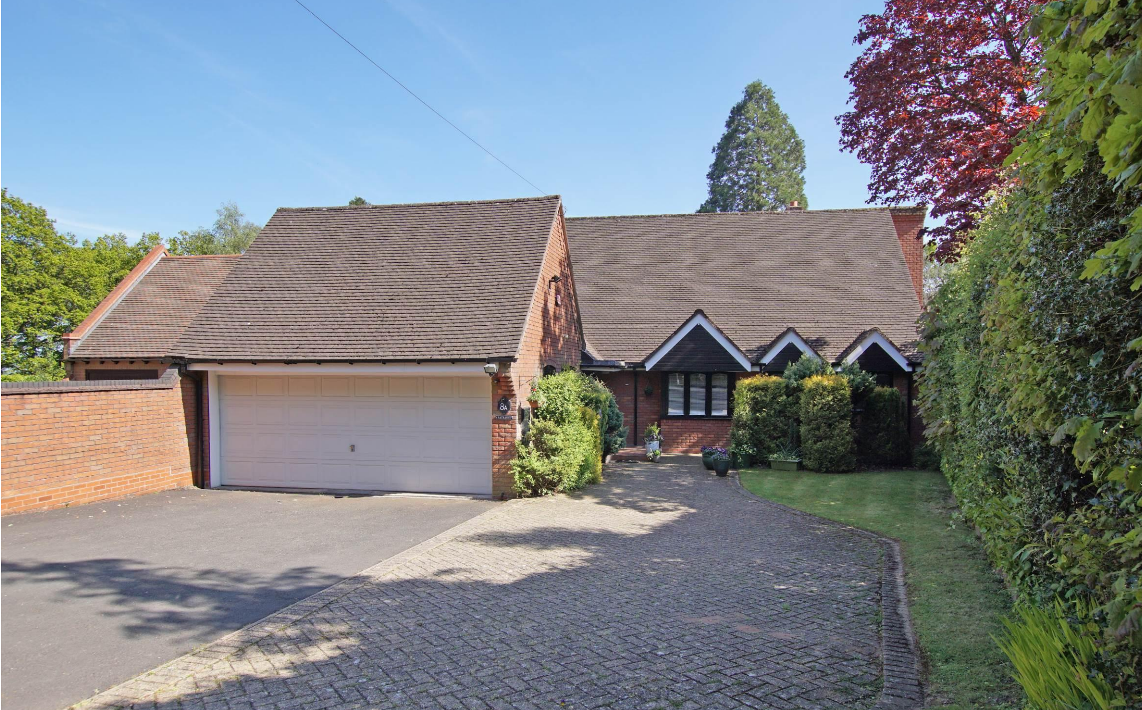
Hathaway, 8a Cherry Hill Road, Barnt Green, B45 8LH | Offers Over £599,000 Spacious Three Bedroom Detached Bungalow