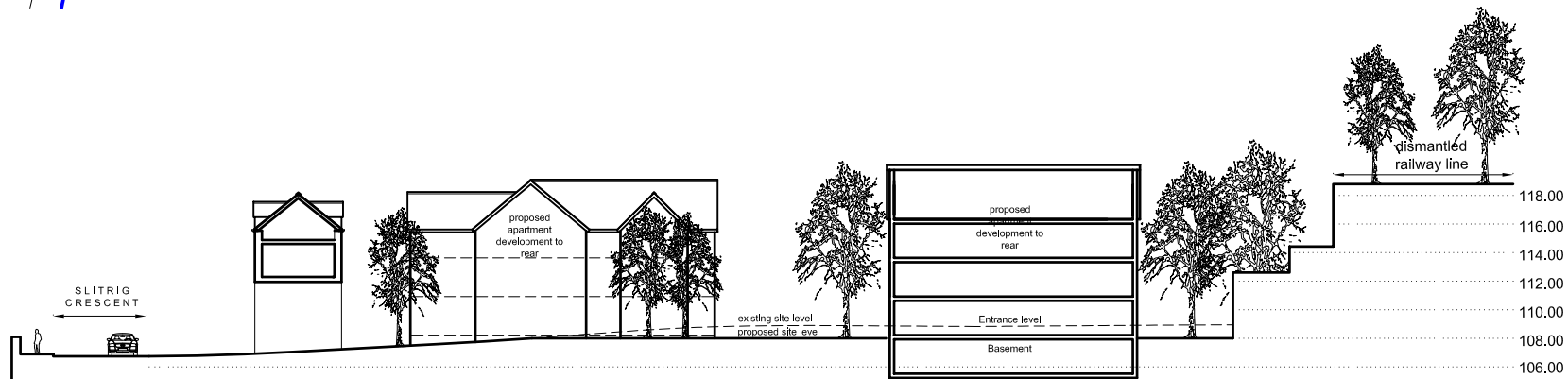
diagrammatic site section AA