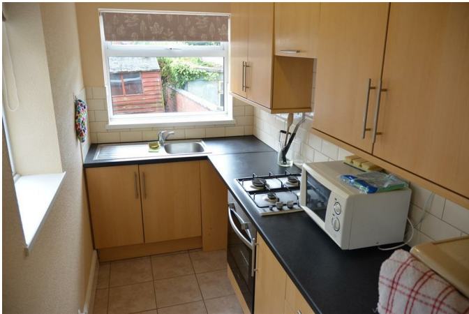
Fitted Kitchen 11'4 x 5'1 (3.45m x 1.55m)

Having a range of modern beech effect wall, base and drawer units with laminated rolled edge working surfaces, inset stainless steel four burner gas hob with matching electric oven and grill, concealed extractor hood, space and plumbing for automatic washing machine, ceramic tiled walls and floor, two UPVC double glazed windows and UPVC opaque double glazed door to rear garden.