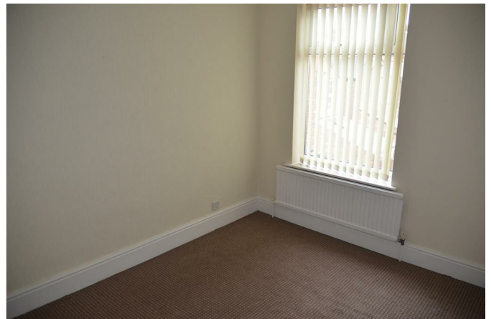
Bedroom Two 10'9 x 8'1 (3.28m x 2.46m)

Having radiator and UPVC double glazed window to rear aspect.