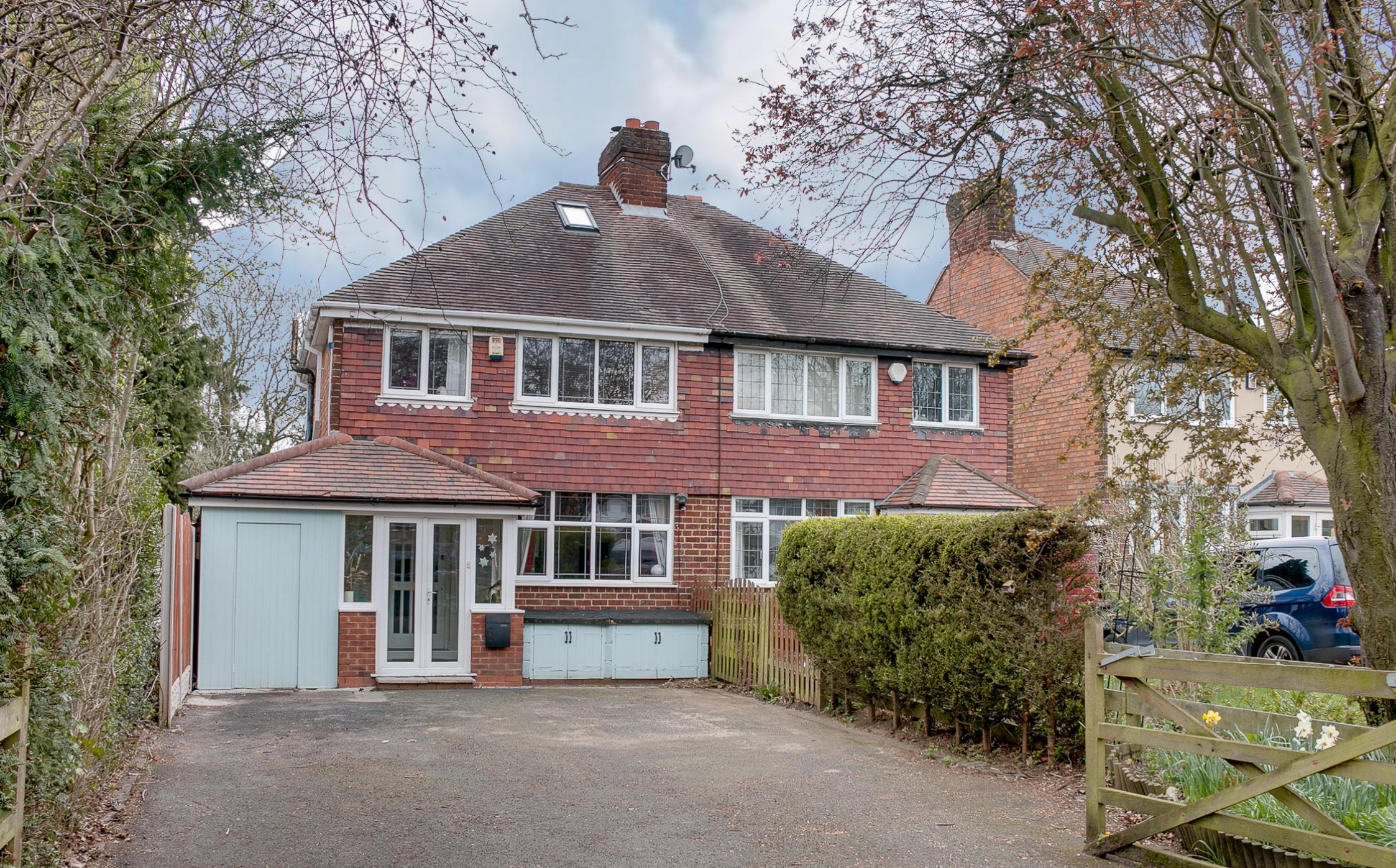
West Heath Road, West Heath, Birmingham, B31 3HD | Guide Price £269,950 Three Bedroom Semi-Detached House