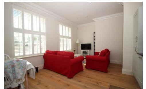
Holburne Place Bath, BA2 6LY