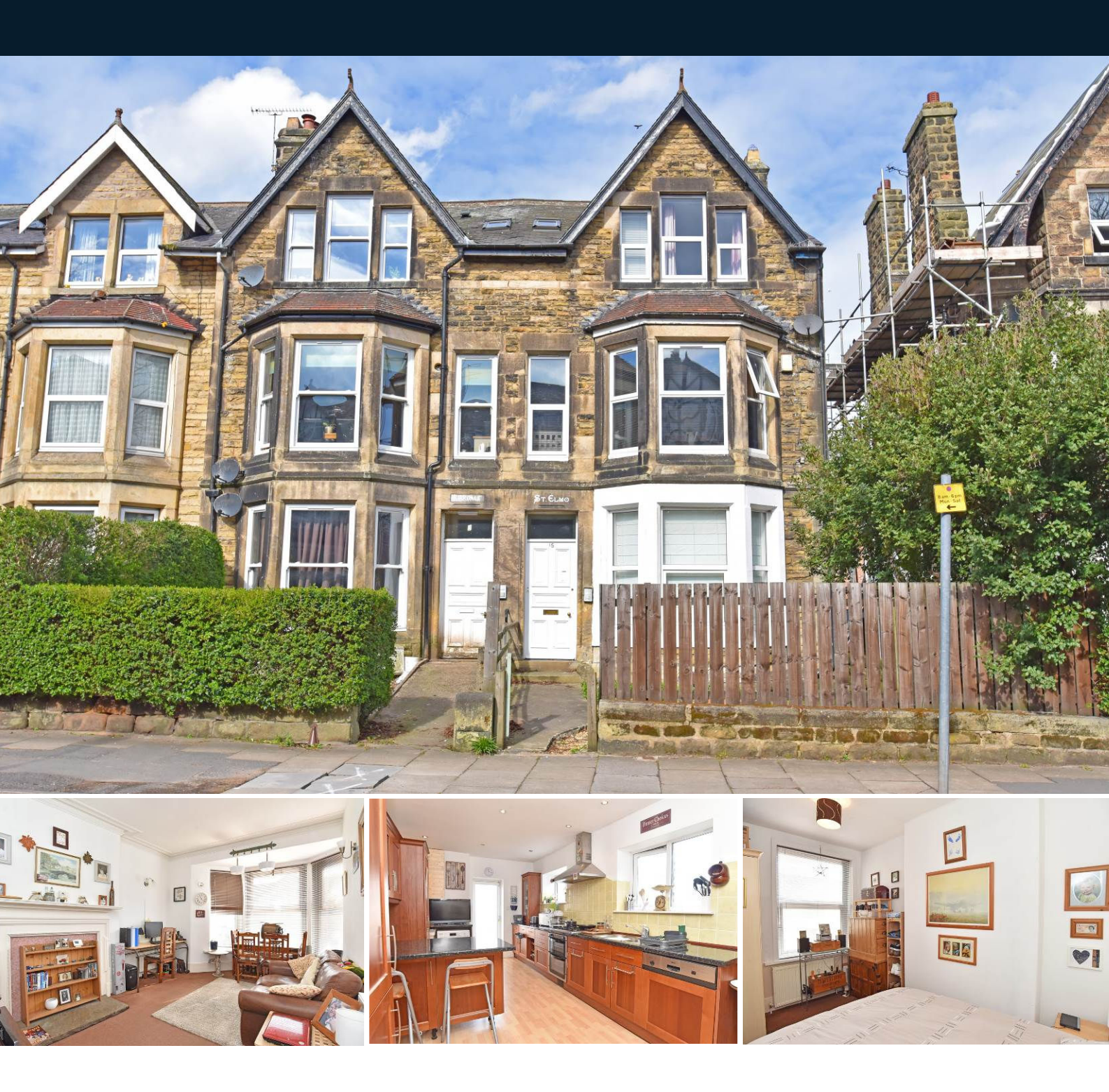
Flat 2, 15 Dragon Parade, Harrogate, North Yorkshire, HG1 5BZ