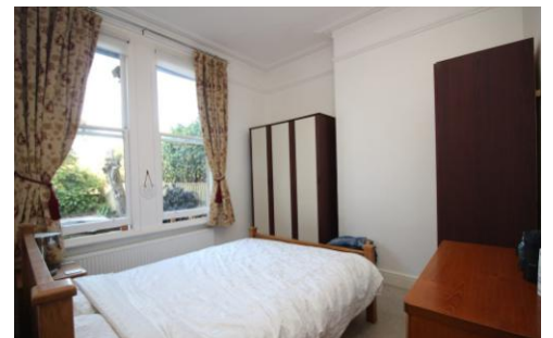
Combe Park Bath, BA1 3NS